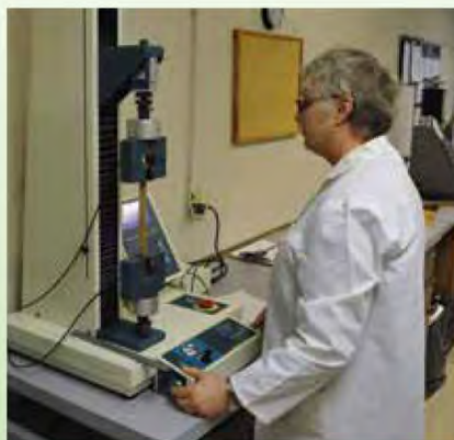
All production checked and each batch recorded for tensile strength

For more information on how you may improve the economics of your operation, please contact: