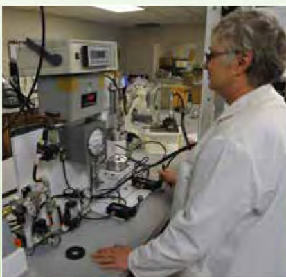
Statistical Data recorded and compared for quality process control