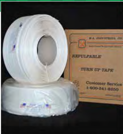
Bleached Turn-up Tape: three rolls per case, single rolls available