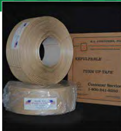
Brown Turn-up Tape: three rolls per case, single rolls available